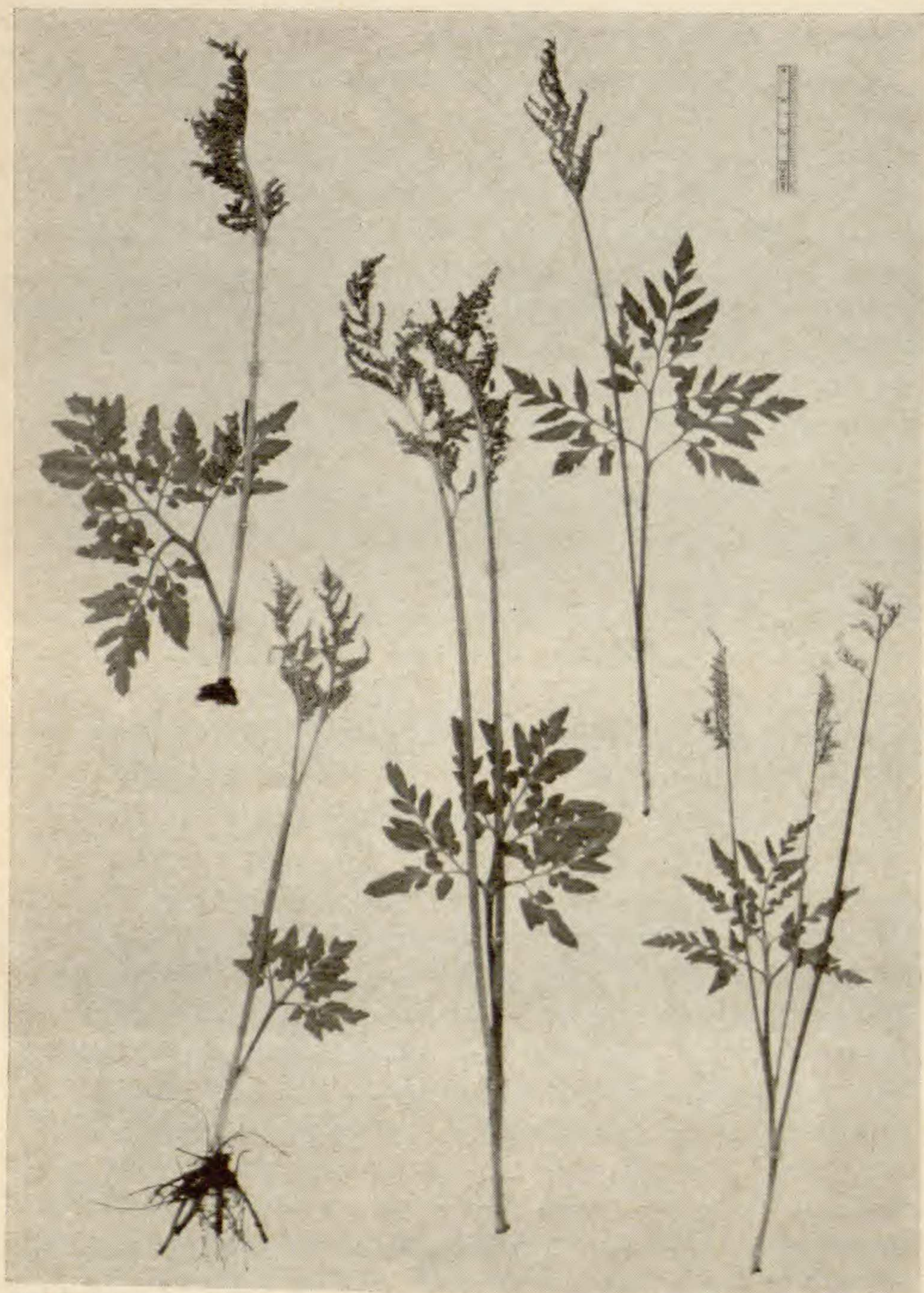
FORMS OF "FERTILE PANICLES" IN BOTRYCHIUM DISSECTUM LEAVES FROM THE LARGE POPULATION NEAR THE HEADQUARTERS OF PINKNEY RECREATION AREA, WASHTENAW COUNTY, MICHIGAN.